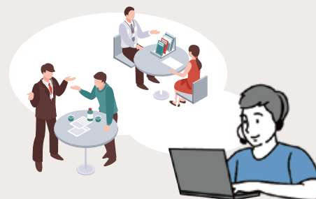
Illustration of booth

Feature industry's updated information *Only in Japanese